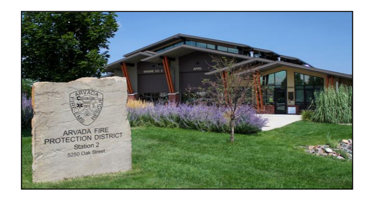
For more information, please visit: www.arvadafire.com